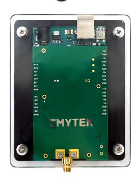
Figure 1. Photo of Power Detector